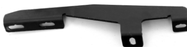
Rear Mounting Bracket