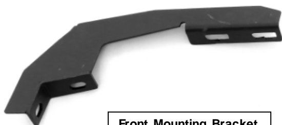
Front Mounting Bracket