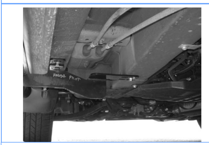
(Fig 1) Driver Front Mounting Location

Start installation from the driver side front of the vehicle. From underneath vehicle, place driver side front bracket in position as shown in (Fig 1).