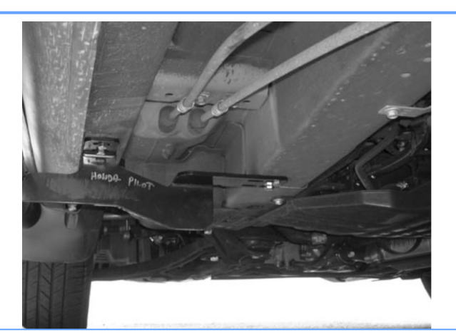
(Fig 1) Driver Front Mounting Location

Start installation from the driver side front of the vehicle. From underneath vehicle, place driver side front bracket in position as shown in ( Fig 1 ).