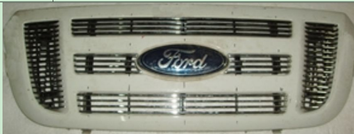
Figure 1 – Front View of positioning Billet Grille