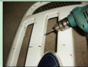
Figure 2 – Dill holes on the grille shell