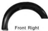
Front Right Flare