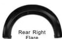
Rear Right Flare