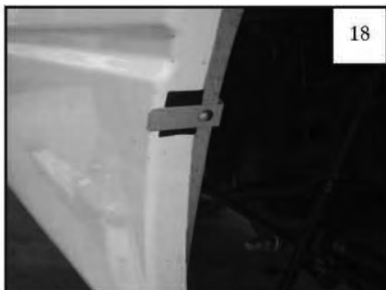
Install a Clip (CL1-0009) over each of the six Tabs (MT1-0014) placed on the sheet metal in Step 17.