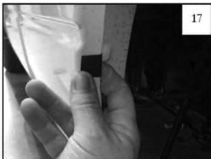
Wrap a Tab (MT1-0014) around the wheel well sheet metal, centered over each of the six marks made in Step 16.