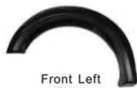
Front Left Flare