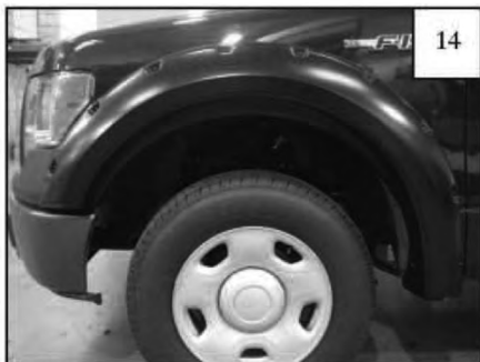
Completed front flare installation.