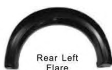
Rear Left Flare