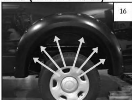
Hold flare to vehicle and mark the location with a grease pencil of the six holes in the flare.