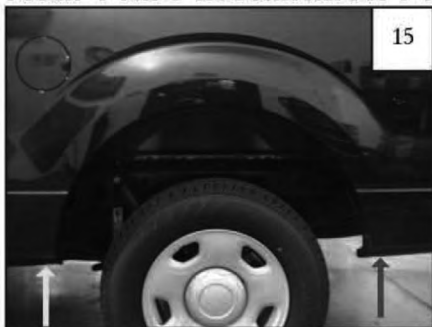
Remove two factory bolts with a 10 mm socket wrench. Save for reinstallation.